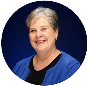
Emotional Wellness By April Lane, MPH, CHES

Spring is finally here, and it's about time! This winter has been one of the coldest and rainiest in several years and, I don't know about you, but I'm ready for some sunshine. Winter can take its toll on us in so many ways. Cold temperatures, rain, snow and shorter days can affect us physically and emotionally, and while most of us manage, and even enjoy the changing seasons, some individuals such as myself, develop a type of depression known as Seasonal Affective Disorder (SAD). Symptoms of SAD may include feeling depressed, low energy, agitation, feeling sluggish, or changes in appetite. Typically, symptoms of SAD occur during late fall or early winter and go away in spring and summer.