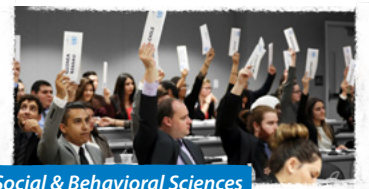
Social & Behavioral Sciences